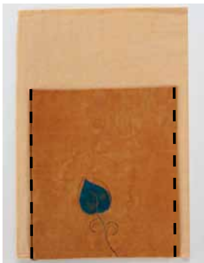
Fig. 4. Topstitch pocket to flap

will be trimmed later. From the right side of the cover, stitch through all layers \frac{1}{8} " from the raw edges.