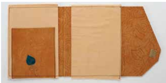
Fig. 5. Position flaps & topstitch all around

Following figure 5, place the flap on the inside of the cover so the folded edge lies on the right edge of the center piece of interfacing in the cover. The flap raw edges will hang over the top and bottom edges of the cover. Topstitch along the flap fold through all layers. To secure the flap at the top and bottom, turn the cover over and stitch \frac{1}{8} " from the cover edge.