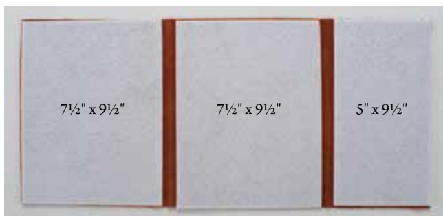
Fig. 2. Position fusible interfacing

Lay the painted cover right-side down on the ironing board. Following fig. 2, position the 5" x 9½" interfacing at the right end of the fabric. Place a 7½" x 9½" piece at the other end. Center the remaining piece between these two. The top and bottom raw edges should all be even. You will have about ½" space between the pieces. This allows an easy fold over the calendar. If desired, you can hold the interfacing in place by lightly glue sticking it to the fabric.