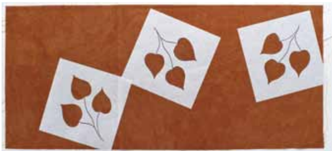
Fig. 1. Place freezer-paper stencils

Trace the leaf stencil (page 4) onto the dull side of freezer paper. Cut out the shapes using an X-acto knife or paper scissors. Make 3. Iron these stencils, shiny-side down, on the right side of the 9½" x 21" cover fabric (fig. 1).